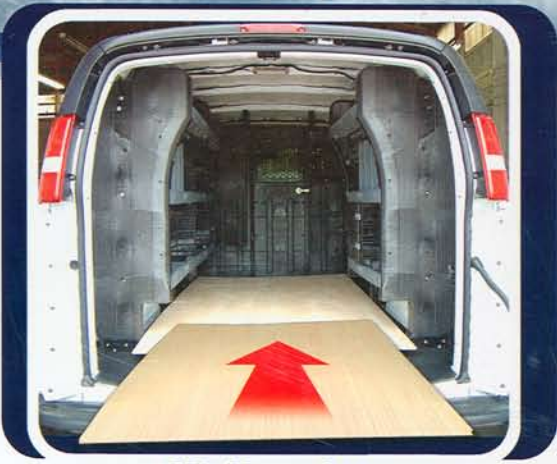
4X8 Sheet Storage